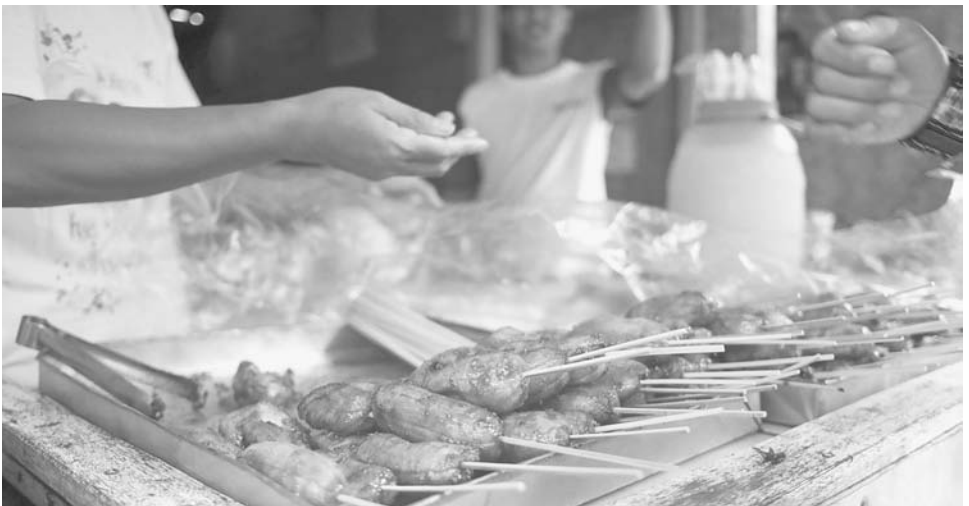
Fried banana, one of the most common street foods in The Philippines.

While not nearly as elaborate as Mexican elotes , corn or mais is simply prepared either boiled on the cob or barbequed in the husk.